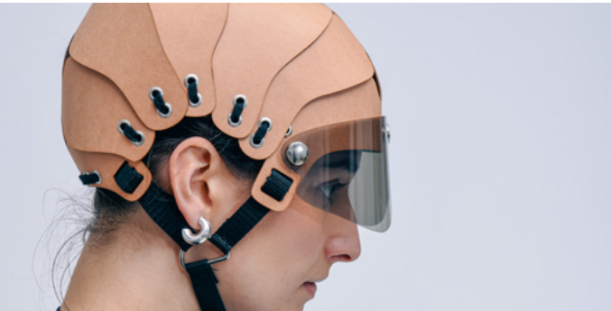
“Scaber” cycling helmet, Erik Naujok