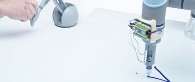
»Remote Touch Control«, photo: © Dominic Domingos Eger (»Matters of Activity«)

Demonstration: “Remote Haptic Control”: Sat./Sun. 3 p.m., 4 p.m. and 5 p.m. Meeting point: Building E, RPLab