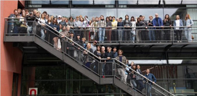
Student intake 2024/25

Guided tours by students: Sat./Sun. 1 p.m., Sun. 3 p.m. Meeting point: In front of the woodwork workshop, entrance to H0.02