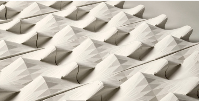
“Reflecting wall”

Guided tours by students: Sat./Sun. 12 p.m. and 4 p.m. Meeting point: Building A (2nd floor, room A.201)