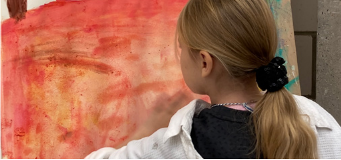
A child painting in art therapy, photo: © Uwe Hermann