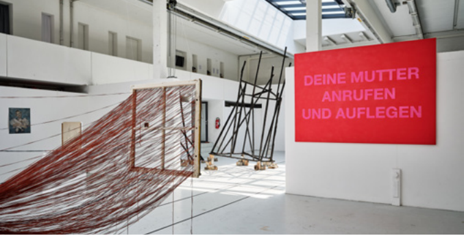
Sculpture tour 2024

Guided tours by students: Sat./Sun. 2 p.m. and 4 p.m. Meeting point: in front of Building E