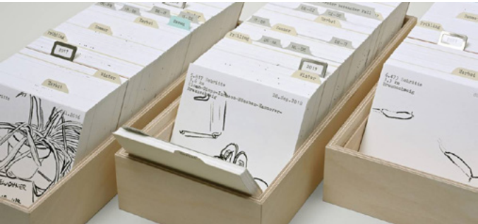
“Steps”, 2024, a work by master-class student Sumi Rho

Guided tours by students: Sat./Sun. 2 p.m. and 4 p.m. Meeting point: In front of the library (Building C on the ground floor)