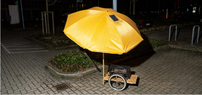
“Goodnight Badnight”, sound installation 2025

Guided tours by students: Sat./Sun. 3 p.m. (German) and 4 p.m. (English) Meeting point: Main entrance to Building T, on ground floor