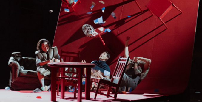
Musical theatre workshop. “Falstaff”, winter semester 2024/25, photo: © Tabita Hub

Guided tours by students: Sat./Sun. 3 p.m. and 5 p.m. Meeting point: main entrance to Building T, on ground floor